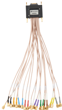
U4432A SMA probe