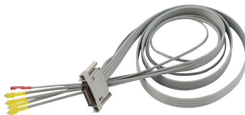
U4433A differential probe